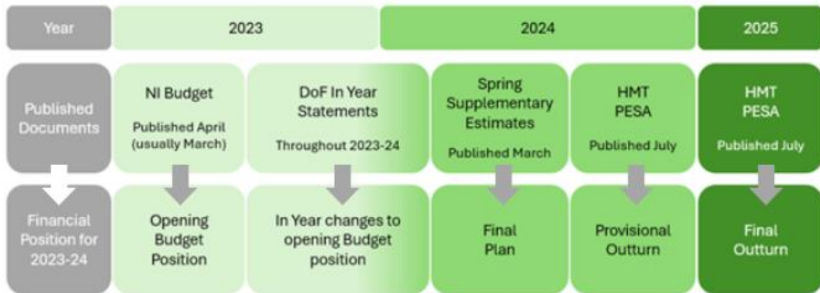
Figure 3 - Financial Positions for 2023-24 and when these change

There are various financial positions published for each year of spending. Figure 3 shows an example for 2023-24 financial year.